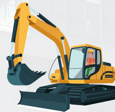
Equipment & Machinery