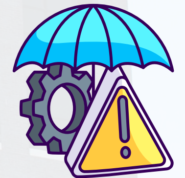
Quality, Health, Safety & Environment